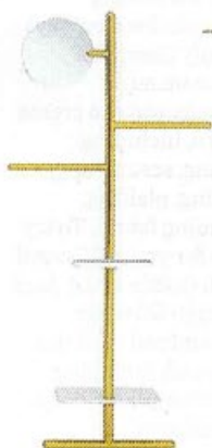
'Camerino' by Brose Fogale, £360, Clippings (clippings.com)

Get your outfit ready for the day with these fashionable clothes horses