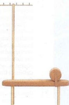
'Avignon' by Gabor Kodolanyi, £450, Codolagni (codolagni.com)