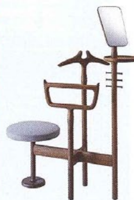
'The Silent Butler', £2,660, Urban Living Interiors (urbanlivinginteriors.co.uk)