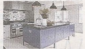
Design solutions: Liz chair and crackle glaze apples (left); Mowlem kitchen (above); anti-slip underlay