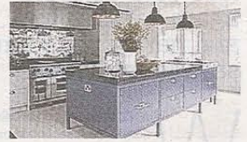
Design solutions: Liz chair and crackle glaze apples (left); Mowlem kitchen (above); anti-slip underlay